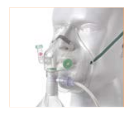
Oxygen and Aerosol Therapy • Variable Oxygen Concentration (Low Flow)